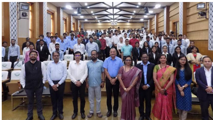
KSRM Organizes Sustainability Hackathon Boot Camp

https://news.kiit.ac.in/schools/ksrm/ksrm-organizes-sustainability-hackathon-boot-camp/