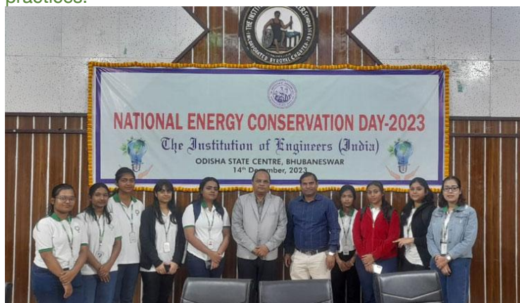
National Energy Conservation Day: KIIT Polytechnic Bags 2nd Prize in Poster Presentation