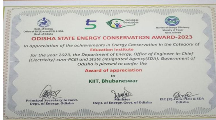
KIIT DU Receives Odisha State Energy Conservation Award (OSECA) 2023

https://news.kiit.ac.in/achievements/kiit-du-receives-odisha-state-energy-conservation-award-oseca-2023/