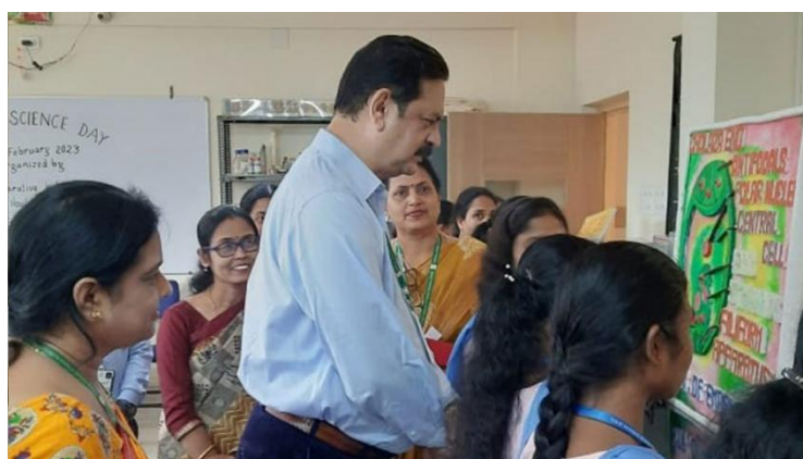
KISS - a sister concern of KIIT Celebrates National Science Day

https://news.kiit.ac.in/kiss/KISS-celebrates-national-science-day/