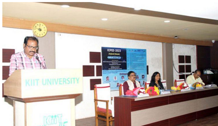
KIIT School of Electrical Engineering IEEE & Bhubaneswar Sub-Section Jointly Organize 'International Conference on Power Electronics & Energy'

research in power electronics, renewable energy, and industry-academia collaboration. The conference concluded with an awards ceremony for best papers, recognizing exceptional contributions in the field.