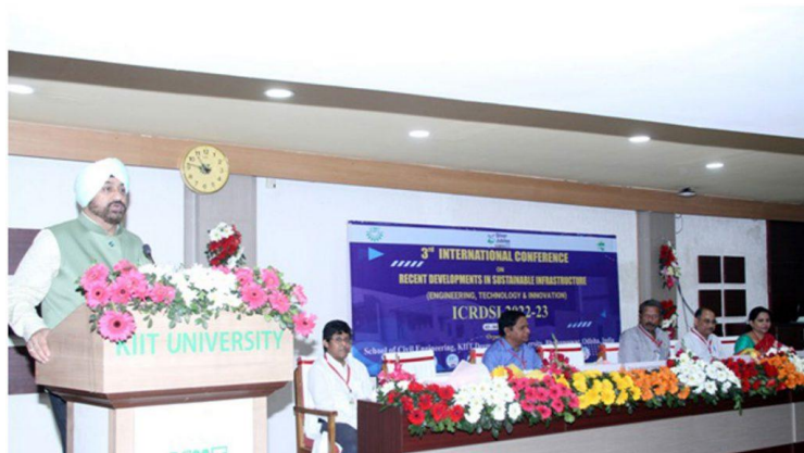
3rd ICRDSI 2022-23 Inaugurated at KIIT School of Civil Engineering https://news.kiit.ac.in/schools/sot/civil/3rd-icrdsi-2022-23-inaugurated-at-kiit-school-of-civil-engineering/