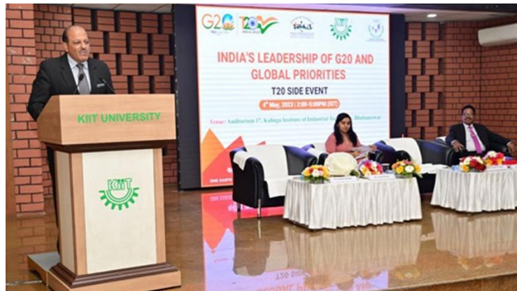
Fig. KIIT DU Hosts the Think20 (T20) Side Event “India’s Leadership of G20 and Global Priorities”

The T-20 Event was organized & coordinated by KIIT International Relations Office in association with KIIT Law School, KIIT School of Management and Kalinga Institute of Social Sciences.