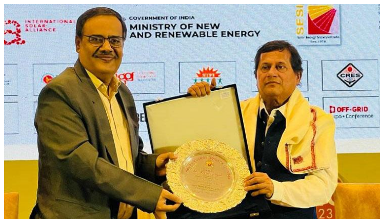
Fig. Solar Energy Society of India Honours Achyuta Samanta https://news.kiit.ac.in/achievements/solar-energy-society-of-india-honours-achyuta-samanta/