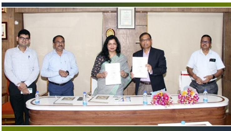
KIIT to Host National Technical Meet of Indian Institute of Metals https://news.kiit.ac.in/kiitnews/kiit-to-host-national-technical-meet-of-indian-institute-of-metals/

KIIT Deemed to be University has signed a Memorandum of Agreement (MoA) with the Indian Institute of Metals (IIM) to host the prestigious National Technical Meet, which includes the National Metallurgist Day and the International Symposium 2023. This much-anticipated event is scheduled to be held from November 22nd to 24th, 2023.