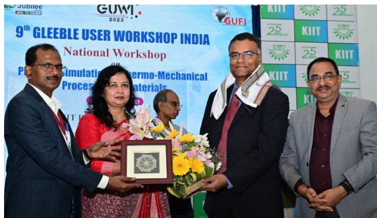
National Workshop on Physical Simulation of Thermal-Mechanical Processing of Materials