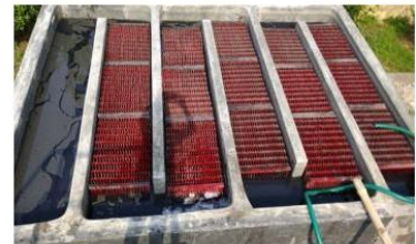
Prototype of 9m 3 /day processing capacity.