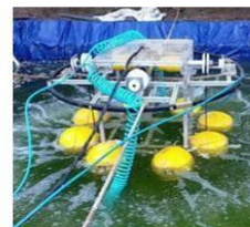
Sediment Aeration System