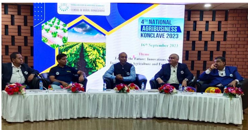
Fig: 4th National Agribusiness Konclave 2023