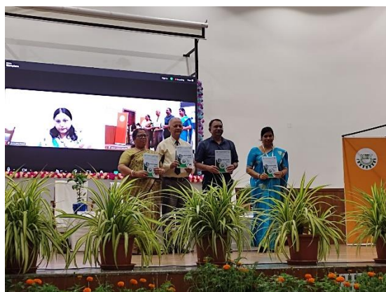
Fig: International Conference on “Embedding Innovative Nursing Education for Sustainable Development”

More details can be found in the link: KINS International Conference on “Embedding Innovative Nursing Education For Sustainable Development”