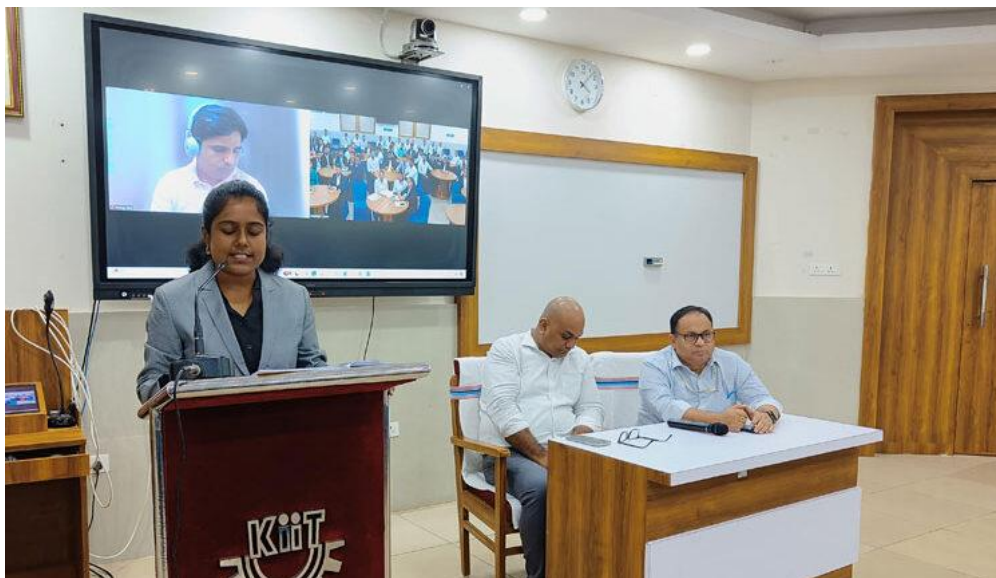
Fig: Guest Talk on “Incubation and Innovation Ecosystem Development”

This event reflects KIIT DU's dedication to empowering rural entrepreneurship and driving environmental sustainability through knowledge-sharing and innovation.