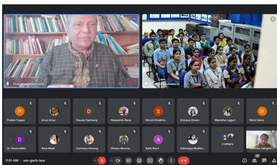
Fig: Insights on Museums, Education, and Climate Action

The seminar concluded with a call for collaborative efforts between universities, museums, and government institutions to ensure museums remain pivotal in education and sustainability in the 21st century.