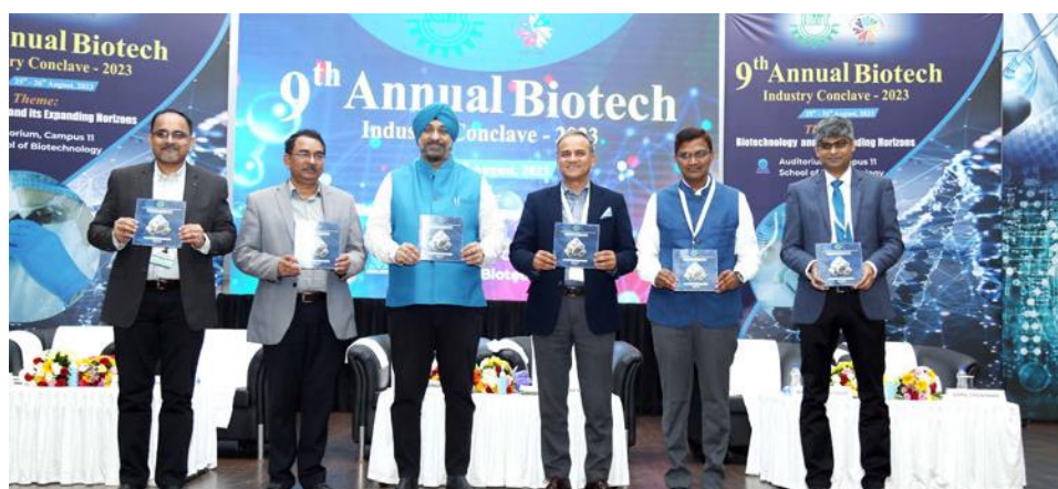
Fig: 9th Biotech Conclave on Sustainability & Innovation