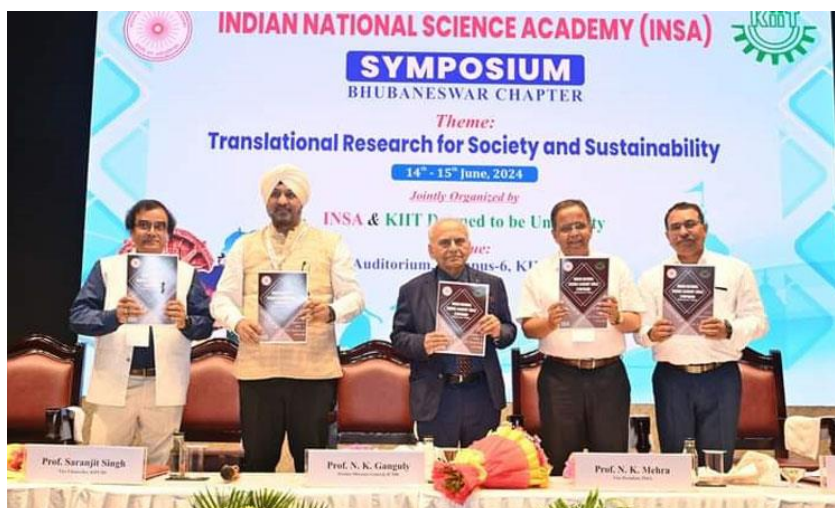
Fig: Symposium on 'Translational Research for Society and Sustainability'

More details can be found in the link: Translational Research for Society and Sustainability