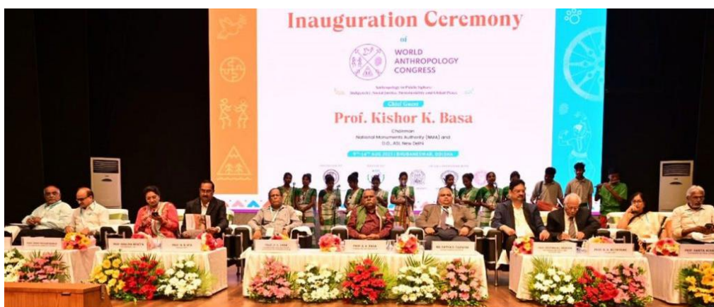
Fig: World Anthropology Congress