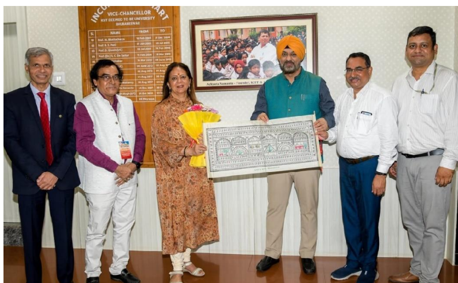
Fig: Star Campus Awards 2024

EARTHDAY.ORG, a global leader in environmental activism, acknowledged KIIT's impactful initiatives in energy conservation.