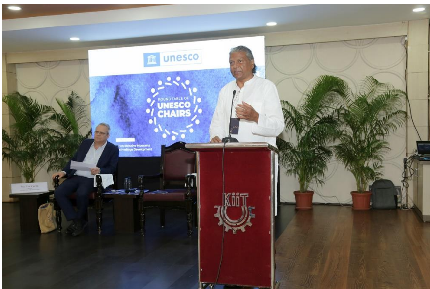
Fig: Roundtable of UNESCO Chairs in South Asia

With UNESCO Chairs playing a crucial role in research, knowledge-sharing, and policy development, KIIT & its sister concern KISS reaffirm their commitment to sustainability, education, and global collaboration for a greener future.