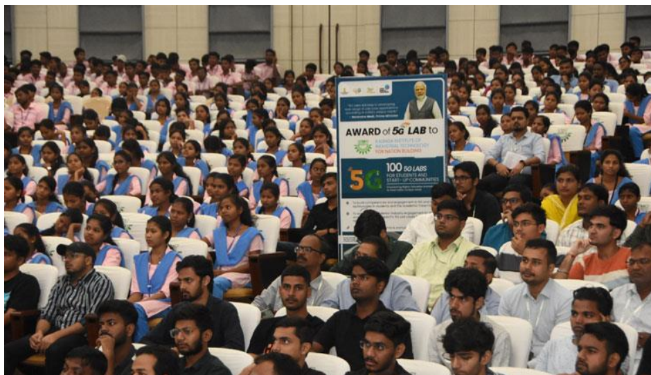
Fig: PM Narendra Modi awarded '5G Use Case Lab' to KIIT-DU

More details can be found in the link: PM Modi Awards '5G Use Case Lab' to KIIT-DU