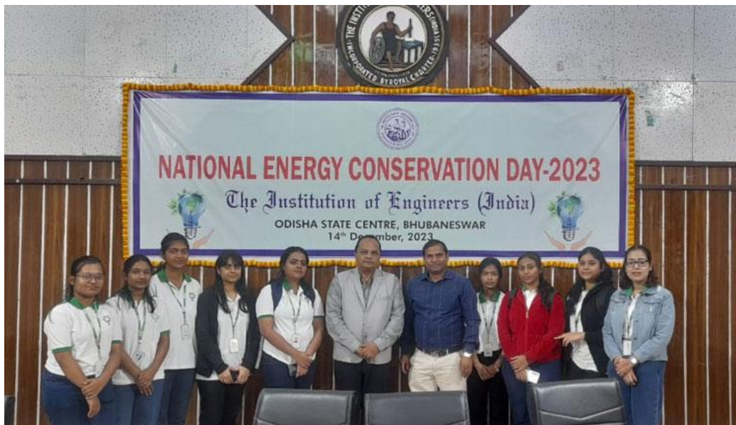
Fig: National Energy Conservation Day Celebration

Environmental Awareness in 2024, provided students a platform to showcase creative ideas on energy conservation. By participating, students gained valuable insights into responsible energy practices, reinforcing KIIT's commitment to sustainability and environmental consciousness.