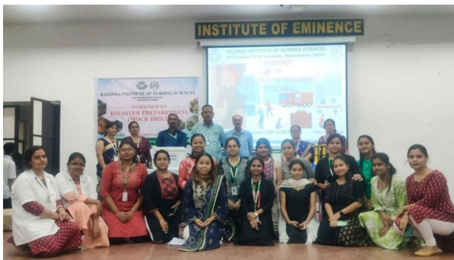
Fig: Disaster Nursing Management Workshop

sustainability and resilience, equipping future professionals with critical disaster management skills for environmental and community well-being.