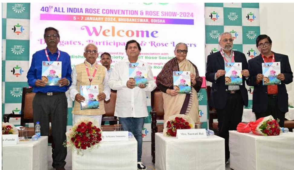
Fig: All India Rose Convention and Rose Exhibition

More details can be found in the link: All India Rose Convention and Rose Exhibition