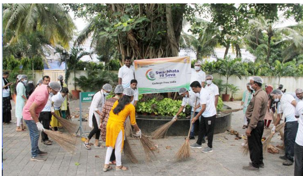
Fig: Massive Swachhata Hi Seva Drive on Campus

Senior faculty, staff, and medical professionals actively participated, reinforcing the message of cleanliness. The initiative emphasized year-round efforts to maintain a clean and green campus, reflecting KIIT DU's dedication to sustainability.