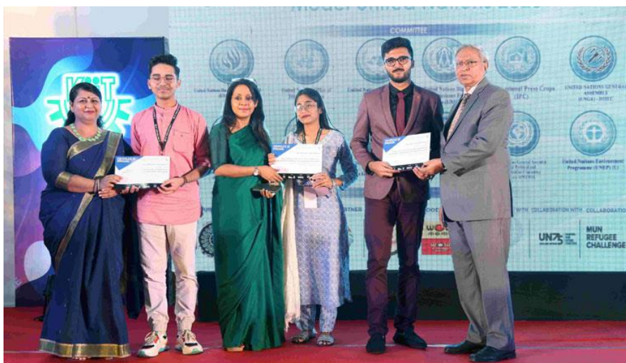
Fig: 10th MUN on Global Sustainability Hosted

More details can be found in the link: KiiTIS MUN Concludes with 800 students participation