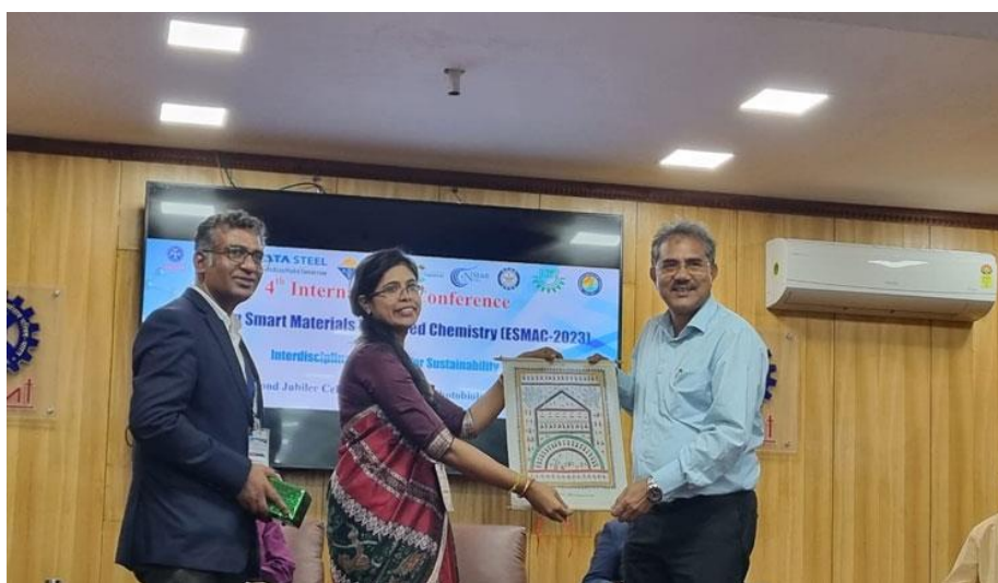
Fig: 4th International Conference on "Emerging Smart Materials in Applied Chemistry &