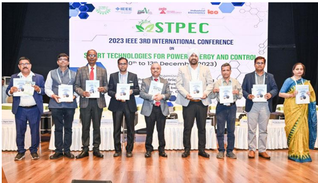
Fig: 3rd IEEE International Conference on Smart Technologies for Power, Energy and Control