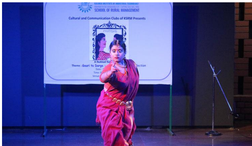
Fig: 'Pratibimb' – A Street Theatre Festival