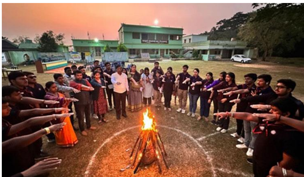
Fig: NSS Unit Promotes Sustainability & Green Environment Awareness at Barimund Village

The NSS unit of KSFH, KIIT DU, organized a seven-day Winter Special Camp (Dec 20–26, 2023) at Barimund village, Bhubaneswar, promoting sustainability and social awareness. Under the supervision of Dr. Smruti Ranjan Das, the camp included a plantation drive, tobacco awareness rally, fire safety training, and a cleanliness drive at Baliyatra ground. A dental checkup camp by KIDS and sessions on menstrual hygiene, election awareness, and superstitions were conducted. The camp concluded with a prize distribution, cultural events, and a bonfire. This initiative, supported by KIIT DU’s leadership and NSS officials, fostered environmental consciousness and community well-being.