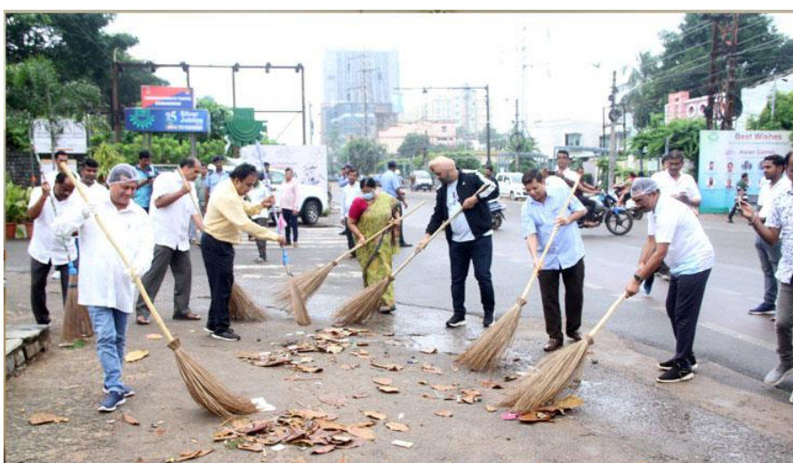
Fig: Swachhata Pakhwada at KIIT