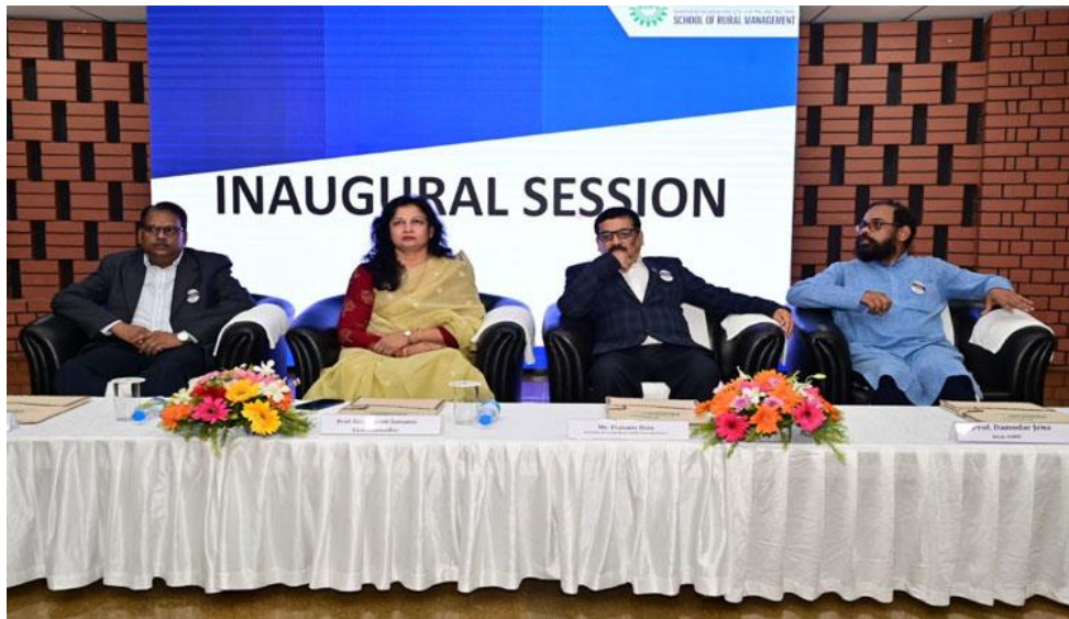
Fig: 4th National Rural Management Konclave 2023

Vice Chancellor, KIIT DU, highlighted KIIT's mission to translate knowledge into impactful solutions for society.