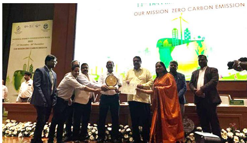
Fig: Odisha State Energy Conservation Award (OSECA) 2023

Aligned with KIIT DU's commitment to sustainability and environmental awareness, the event featured an Exhibition on Energy Conservation, showcasing energy-efficient models and products. KIIT DU actively promotes energy conservation through innovative strategies and best practices.