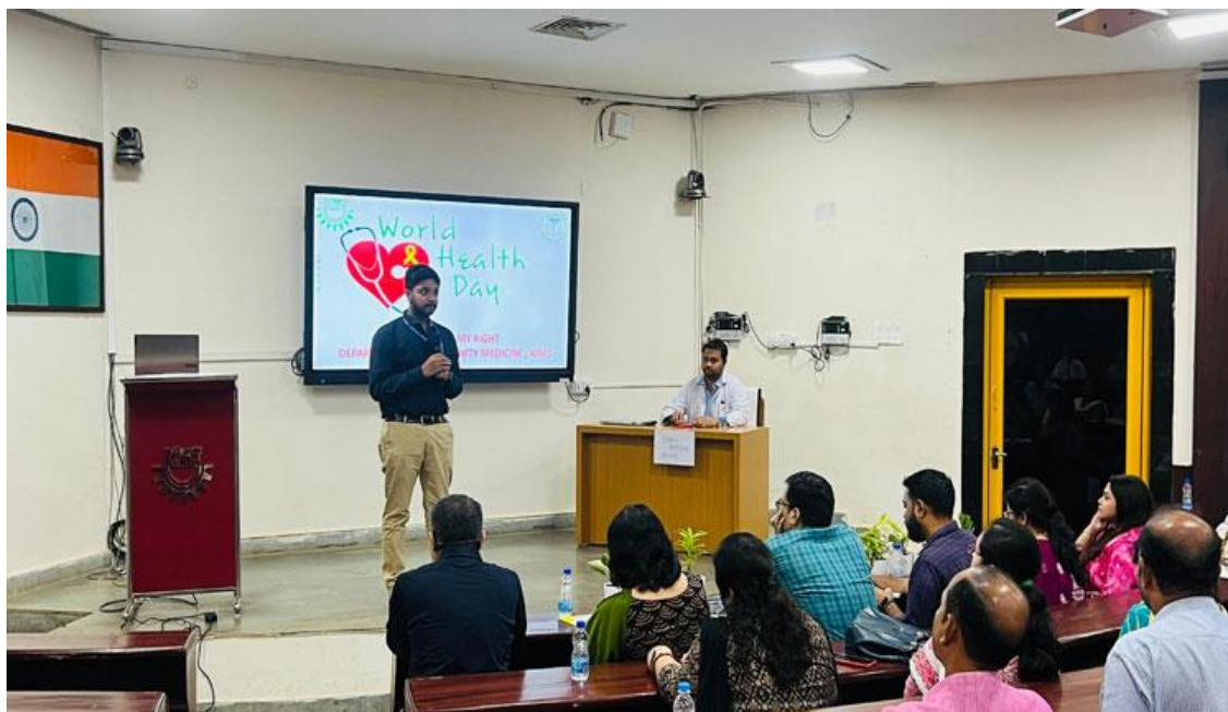
Fig: Two-Week Long World Health Day 2024