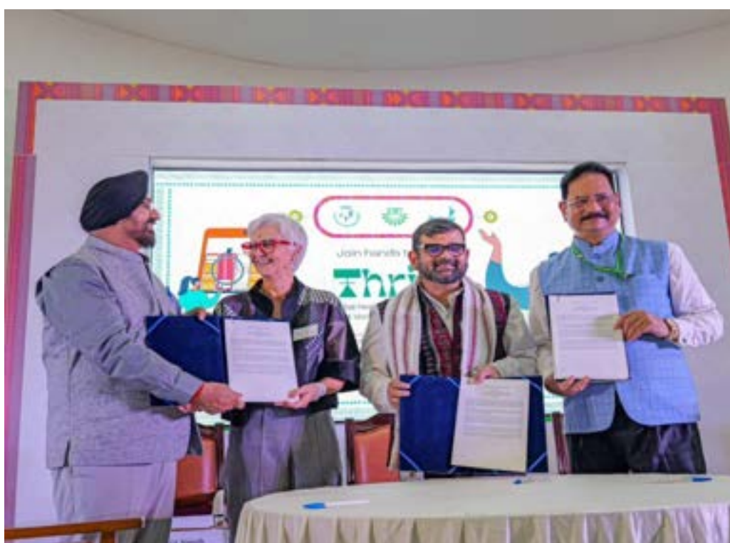
Fig: Launch of ‘THRIVE’ To Enhance Tribal Health & Youth Empowerment

Through THRIVE, KIIT DU continues its impactful role in promoting inclusive education, healthcare advancements, and skill development, aligning with its broader mission of sustainable societal development in 2024.