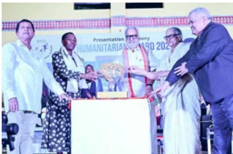
Fig: First Lady of Kenya Rachel Ruto E.G.H Receives Prestigious KISS Humanitarian Award 2022

More details can be found in link below: First Lady of Kenya Rachel Ruto E.G.H Receives Prestigious KISS Humanitarian Award 2022