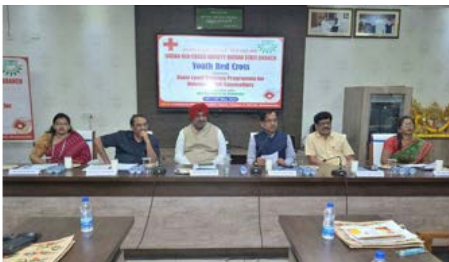
Fig: Youth Red Cross, Odisha, and KIIT Host State-Level Training Camp for Counsellors

KIIT Deemed to be University (KIIT-DU), in collaboration with Youth Red Cross (YRC), Odisha, organized a three-day State-Level Training Camp for Untrained Counsellors from May 10th to 12th, 2024. Over 70 counsellors from across Odisha participated in sessions on climate change, disaster management, first aid, and fire safety, conducted by eminent experts. The event, graced by KIIT-DU leadership, reinforced the university's commitment to societal sustainability by equipping counsellors with essential skills to guide and support youth effectively. The training was managed by faculty members from various KIIT-DU schools, highlighting the institution's dedication to community service, resilience building, and sustainable development initiatives. This initiative reflects KIIT's broader mission of fostering social responsibility and youth empowerment through impactful training and education.