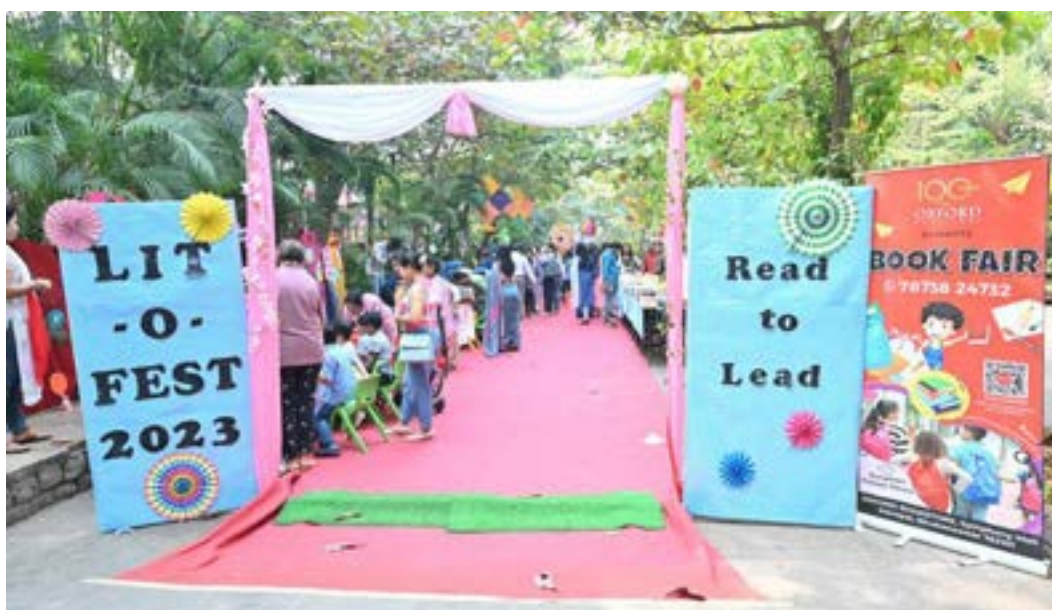
Fig.: KiiT International School National Children Literary Fest

KIIT Deemed to be University (KIIT DU) reaffirmed its commitment to societal sustainability through the ninth edition of the National Children Literary Fest (NCLF) 2023, organized by KiiT International School on November 25-26, 2023. As India's first and only literary fest for school students, NCLF hosted 1,000+ students from 75 schools nationwide, fostering creativity and intellectual growth. Eminent personalities like Dr. Ricky Kej, Amitabh Kant, Ruskin Bond, and others engaged with young minds. The fest featured literary discussions, storytelling, competitions, art workshops, and cultural performances, promoting freedom of expression, ethics, and creativity. A prelude event, 'Lit-o-Fest', encouraged artistic expression among children. This initiative reflects KIIT DU's dedication to education, culture, and societal development, enhancing its global reputation for academic excellence and community engagement.