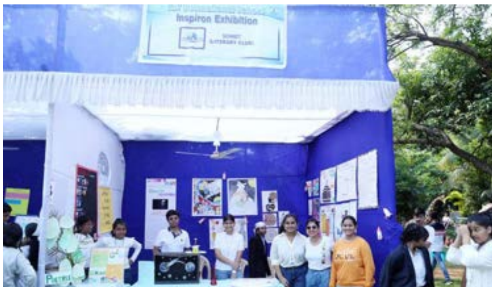
Fig.: KiiT-IS Inspiron Exhibition and Fun Binge