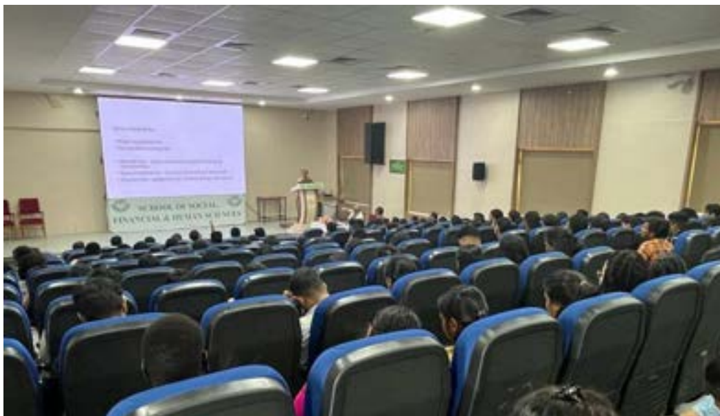
Fig.: Seminar on Gender in Economic

More details can be found in link below: KSFH Organizes Seminar on Gender in Economic