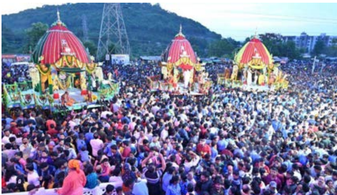
Fig: Rath Yatra Celebrated at Shrivani Kshetra

More details can be found in the link: Rath Yatra Celebrated at Shrivani Kshetra