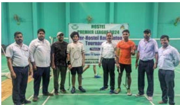
Fig: Inter-Hostel Premier League (Badminton & Basketball Tournament)

The closing ceremony on 5th April 2024 was graced by university officials, who distributed prizes, certificates, and mementos. This initiative highlights KIIT DU's dedication to nurturing talent, promoting diversity, and strengthening student communities through sports and extracurricular activities.