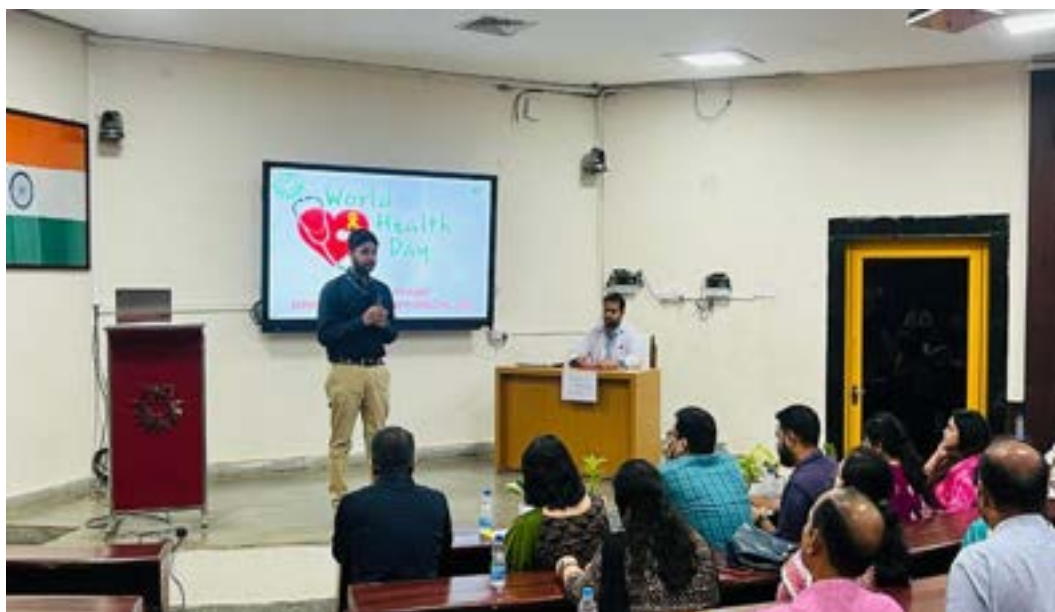
Fig: World Health Day 2024

More details can be found in the link: Department of Community Medicine