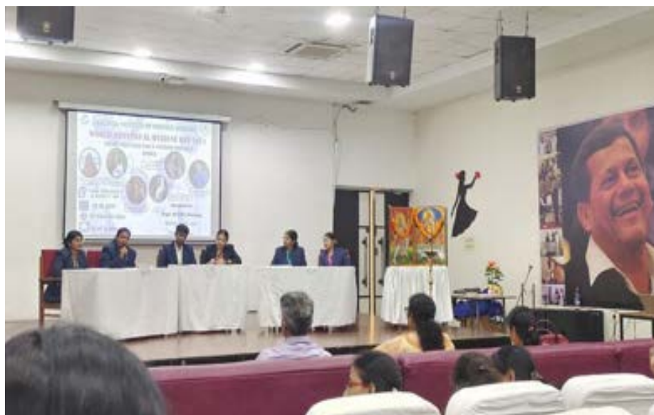
Fig: World Menstrual Hygiene Day

to gender equality and health education. This initiative aligns with KIIT DU's dedication to the United Nations' Sustainable Development Goals (SDGs), particularly SDG-3 (Good Health and Well-being) and SDG-5 (Gender Equality). Through such impactful events, KIIT DU continues to foster social awareness and well-being in the community.