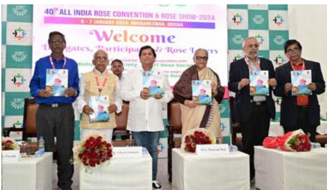
Fig: 40th All India Rose Convention and Exhibition