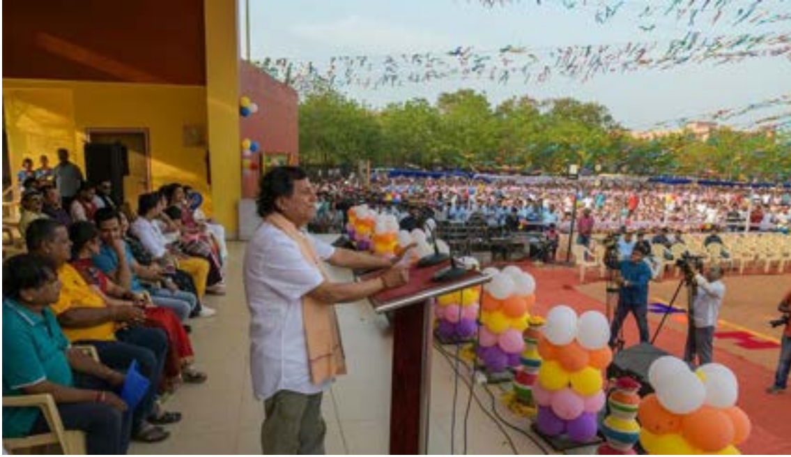
Fig: Holi celebration with Cultural Grandeur

More details can be found in the link: Students celebrate Holi