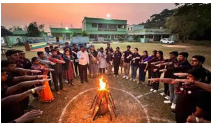
Fig.: Seven Day Awareness Camp at Barimund Village, Mancheswar, Bhubaneswar