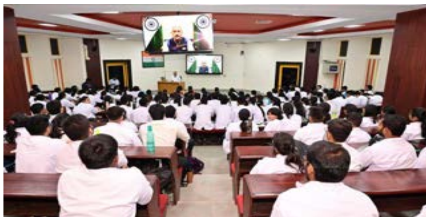
Fig.: KIIT joins G20 University Connect Program

In a momentous event, KIIT joined the G20 University Connect Program, as per the directive the UGC in a letter dated September 25, 2023. The program, which took place on September 26, 2023, at 2 PM, saw extensive preparations to ensure a seamless experience for all stakeholders. Large LED screens were strategically placed across the university campus, including the Auditorium, Classrooms, Seminar Halls, and Conference Halls across all schools. These arrangements were made to accommodate students, faculty members, and staff who eagerly anticipated the live streaming of the G20 University Connect Program. The event provided an enriching experience for all attendees, allowing them to connect with the global academic community and gain insights from the program. The successful hosting of the G20 University Connect Program reaffirmed our dedication to advancing education, knowledge exchange, and global engagement.