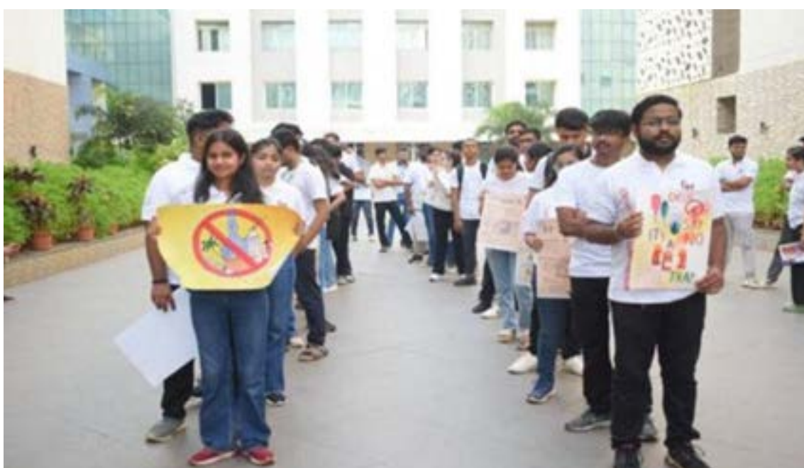
Fig: YRC KIIT Volunteers Organize Drug Awareness Rally Under Nasha Mukta Bharat Abhiyan

This initiative reflects KIIT DU's dedication to social responsibility, youth empowerment, and sustainable societal development. By actively participating in national campaigns like Nasha Mukta Bharat Abhiyan, KIIT continues to contribute towards a healthier and more informed society, aligning with the university's broader goals of holistic development and social impact.