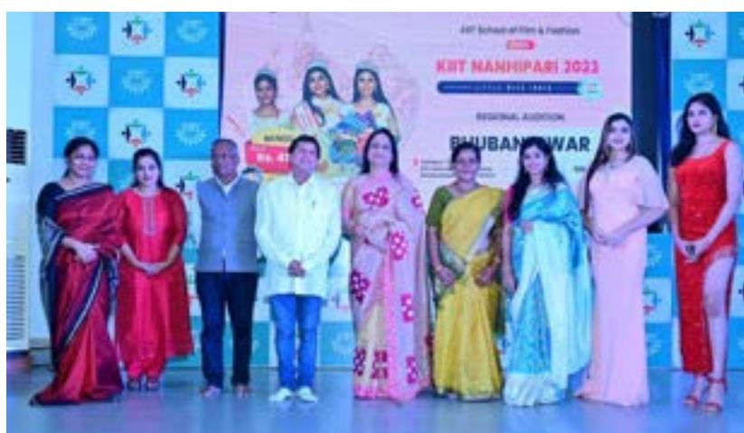
Fig.: 'KIIT Nanhipari Little Miss India' held at Bhubaneswar