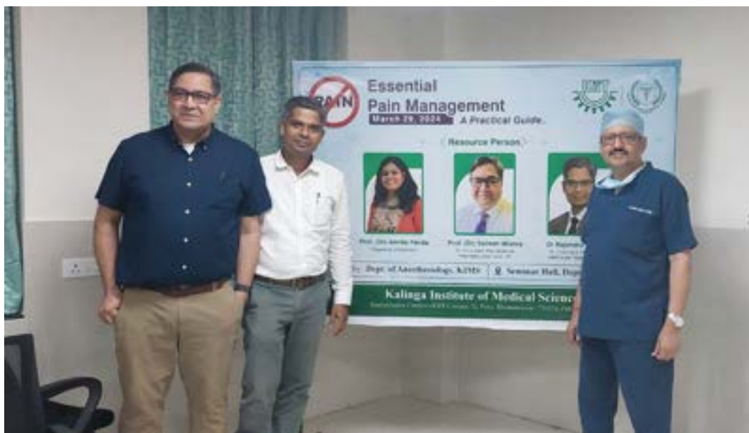
Fig: Essential Pain Management Workshop

More details can be found in the link: Pain Management Workshop