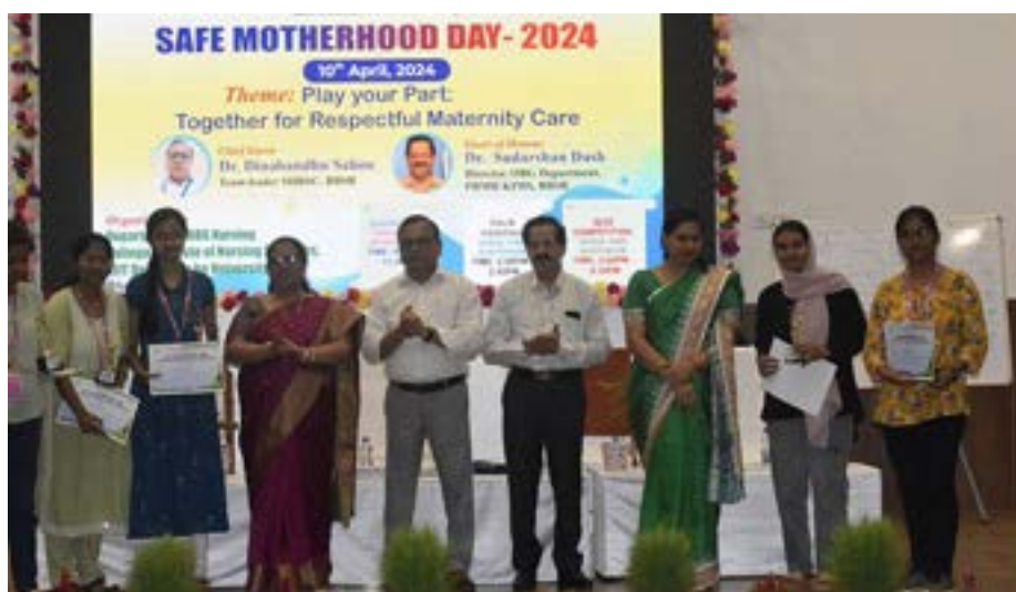
Fig: Safe Motherhood Day

maternal healthcare awareness, aligning with KIIT DU's commitment to societal sustainability. The program featured a socio-drama by GNM students at UHTC Niladri Vihar, highlighting the importance of institutional deliveries and contraception. An inter-university palm painting competition and quiz contest saw participation from leading institutions, with KINS securing top positions. Eminent guests, including Dr. Dinabandhu Sahoo and Dr. Sudarshan Dash, emphasized reducing maternal mortality and ensuring respectful maternity care. A theme-based dance addressed gender discrimination and social challenges. The event reaffirmed KIIT DU's dedication to improving maternal health and fostering community engagement.