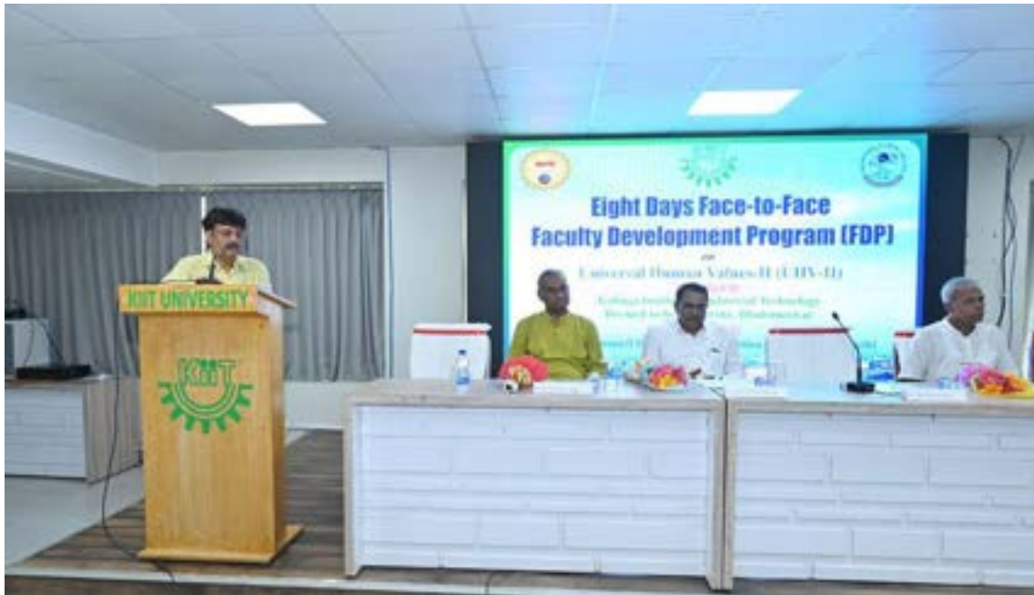
Fig: Faculty Development Program on Universal Human Values

More details can be found in the link: KIIT Organizes Faculty Development Program