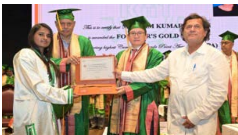
Fig: KIIT Special Convocation 2024: Advancing Women's Education and Global Collaboration

The convocation reaffirmed KIIT DU's role in societal sustainability by promoting quality education, fostering gender equality, and supporting innovation, aligning with the United Nations' Sustainable Development Goals (SDGs).