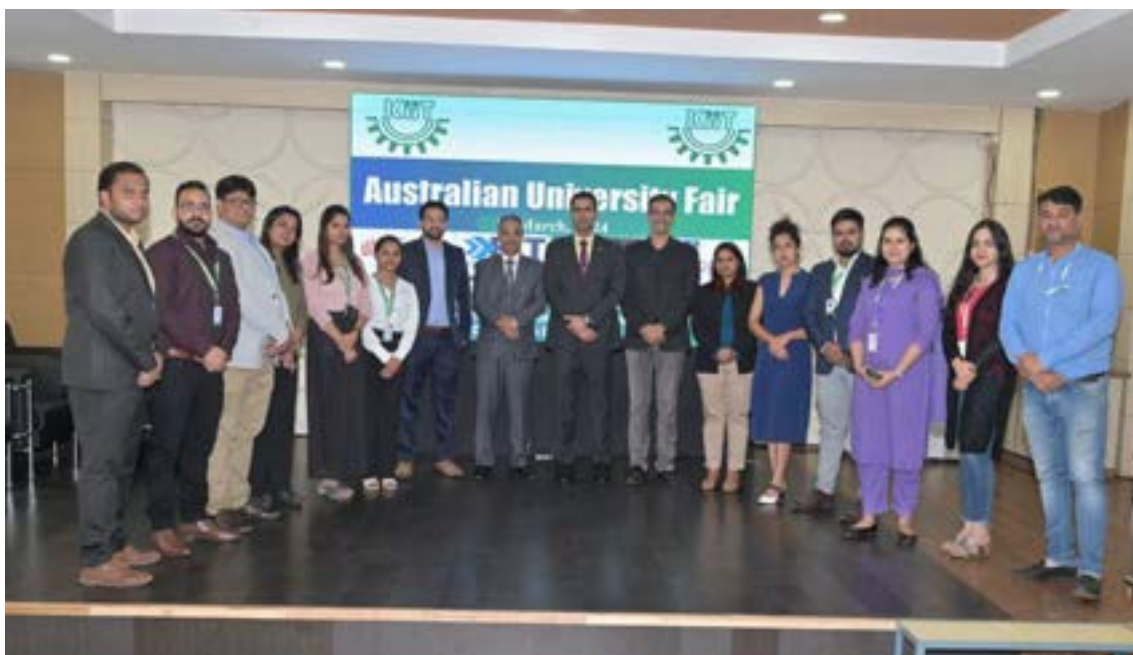
Fig: Australian University Fair 2024

More details can be found in the link: IRO, KIIT Organizes An Australian University Fair