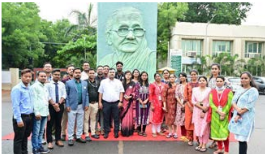
Fig.: World Physiotherapy Day

Physiotherapy Day on Sept. 8, 2023, let's join hands to celebrate with the Physio Fraternity in making a pain-free world. Greetings to all Physiotherapists at KIMS and thanks for your dedication and sincerity.