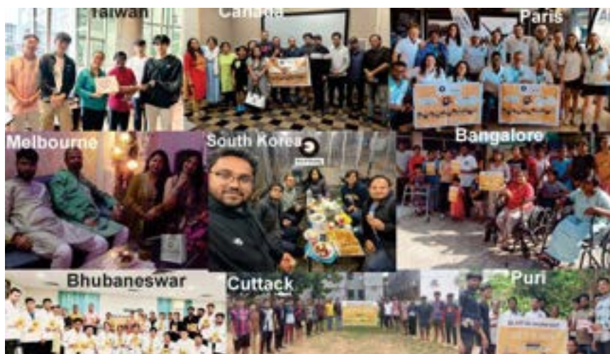
Fig: Art of Giving Celebrated Globally

More details can be found in the link: Art of Giving Celebrated