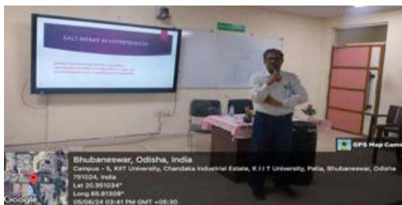
Fig: World Hypertension Day with Month-Long Awareness Programme

KIIT Deemed to be University (KIIT DU) continues its commitment to societal sustainability through various health initiatives. In 2024, the Kalinga Institute of Nursing Sciences (KINS) observed World Hypertension Day with a month-long awareness program aimed at educating the community on hypertension prevention and management. The initiative included health check-up camps, awareness sessions, and interactive discussions involving students, faculty, and healthcare professionals. The program emphasized lifestyle modifications, early detection, and the importance of regular health monitoring. This initiative aligns with KIIT DU's broader mission of promoting health and well-being, contributing significantly to the United Nations' Sustainable Development Goals (SDG-3: Good Health and Well-being). Through such community engagement activities, KIIT DU reinforces its dedication to societal betterment, making impactful contributions to public health awareness and sustainable healthcare practices.