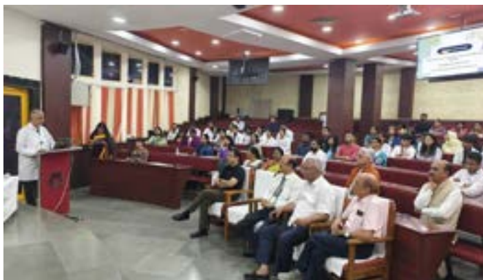
Fig: CME Organized by Department of Community Medicine, KIMS

More details can be found in the link: KIMS Organizes CME to Commemorate World Health Day, 2024