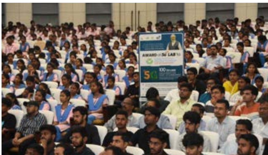
Fig.: 5G Use Case Lab' to KIIT-DU

More details can be found in link below: PM Modi Awards '5G Use Case Lab' to KIIT-DU