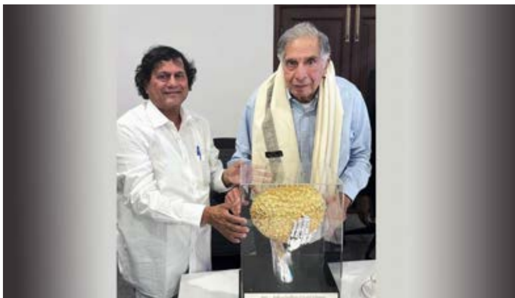
Fig: KIIT Humanitarian Award 2024

More details can be found in the link: Ratan Tata Receives KISS Humanitarian Award