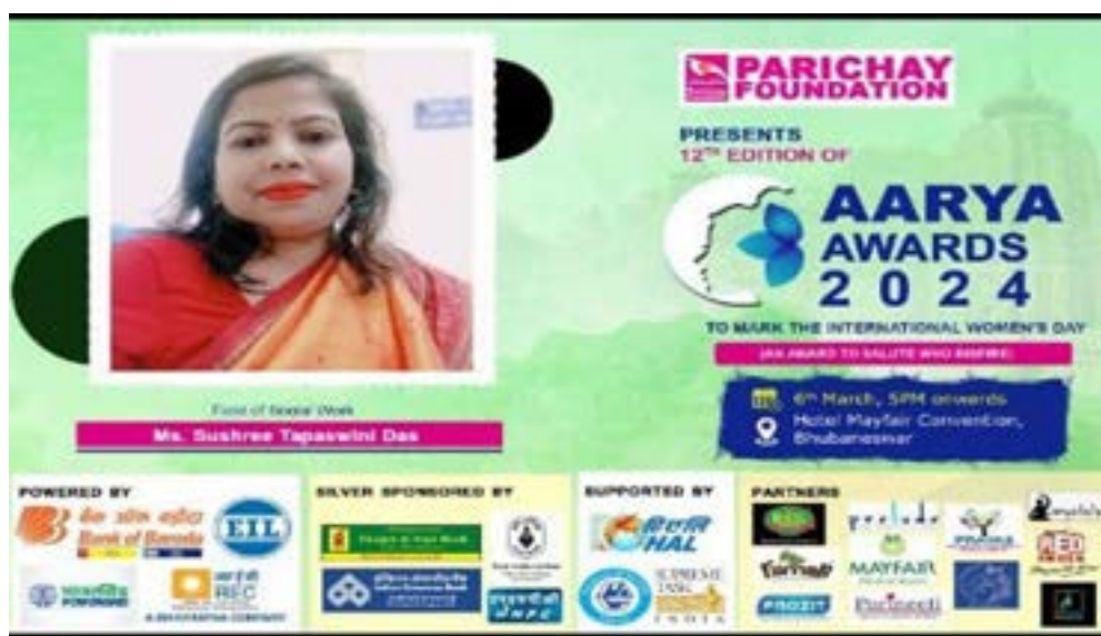
Fig: AARYA Award for Societal Contributions