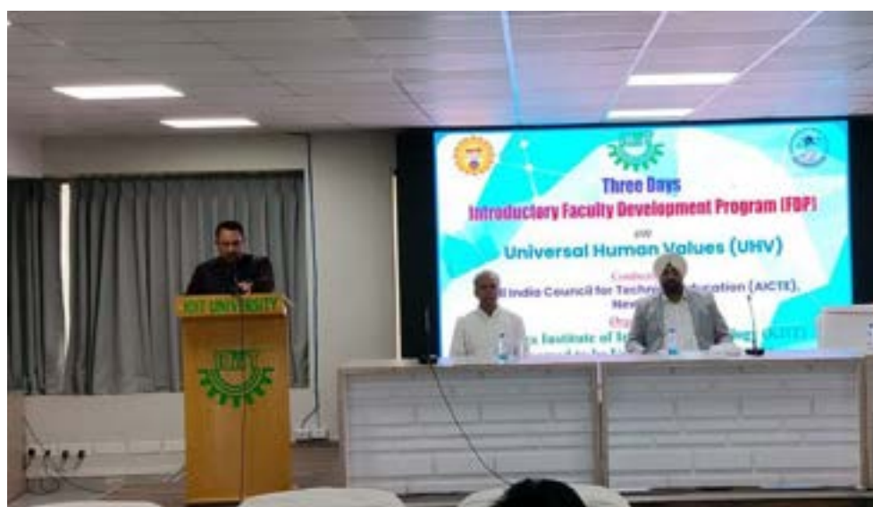
Fig.: FDP on Universal Human Values UHV Held at KIIT