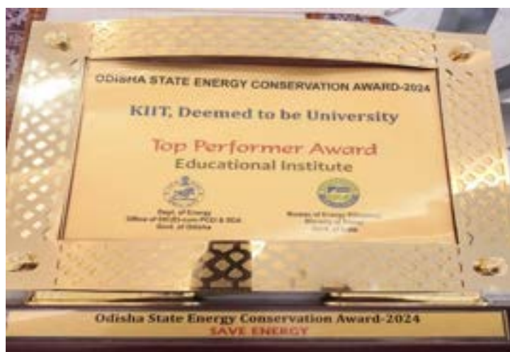
Fig: KIIT Bags Odisha State Energy Conservation Award - 2024

More details can be found in the link: THE Impact Rankings 2024 KIIT Tops