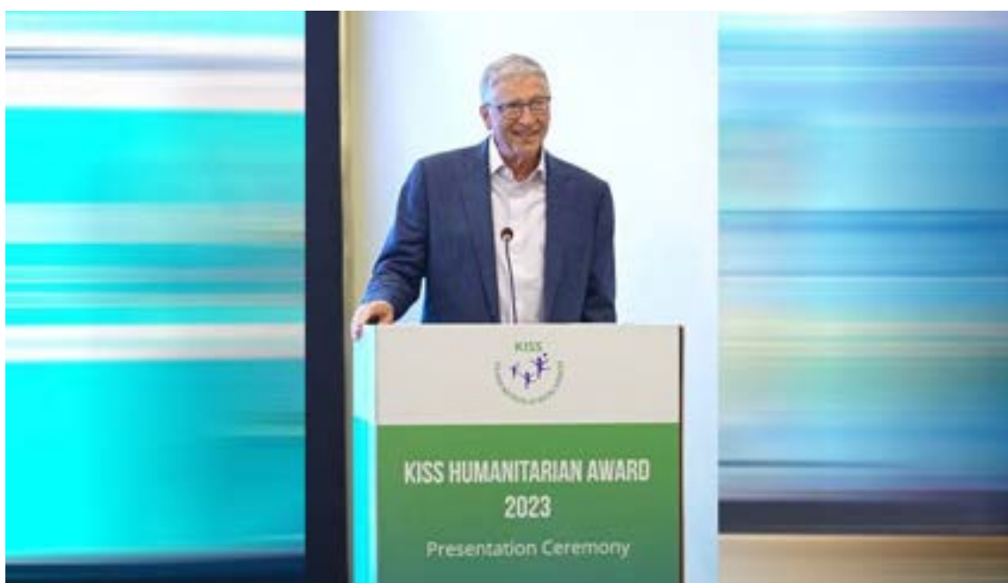
Fig: Bill Gates Receives the Prestigious KISS Humanitarian Award

Instituted in 2008, the KISS Humanitarian Award reflects KIIT DU's commitment to social responsibility. The gold-plated trophy symbolizes humanitarian virtues such as kindness and hope. This recognition further strengthens KIIT DU's global engagement in societal sustainability and its mission to foster inclusive education and social upliftment.