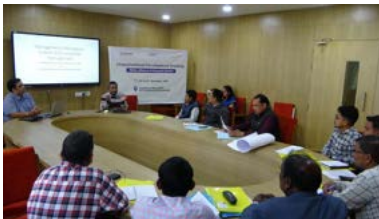
Fig.: Workshop on “Organization Development Training Program for NGOs from Nuapada District, Odisha” More details can be found in link below: Workshop on “Organization Development Training Program for NGOs from Nuapada District, Odisha”