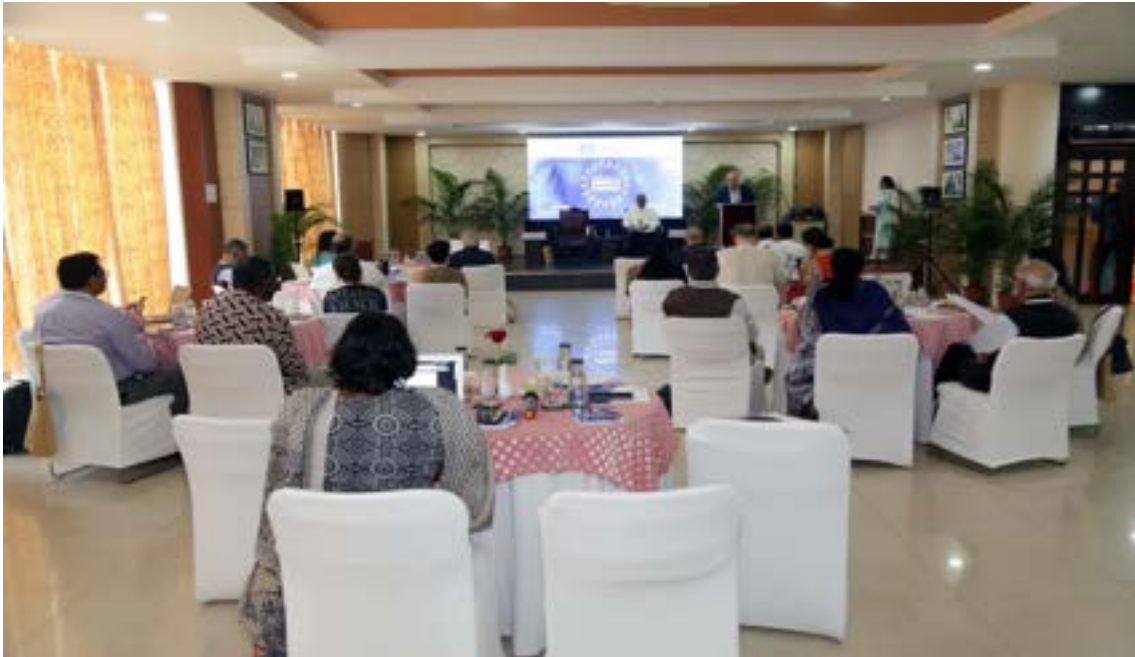
Fig: Roundtable of UNESCO Chairs in South Asia

More details can be found in the link: Roundtable of UNESCO Chairs in South Asia