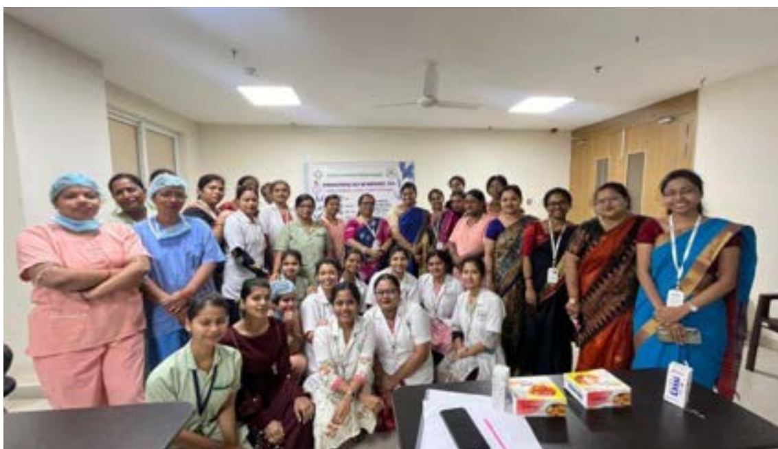
Fig: International Midwives Day

The celebration underscored KIIT DU's dedication to the UN Sustainable Development Goals (SDGs), particularly SDG 3 (Good Health and Well-being) and SDG 13 (Climate Action), reinforcing its role in improving maternal and newborn health outcomes while promoting environmental sustainability.