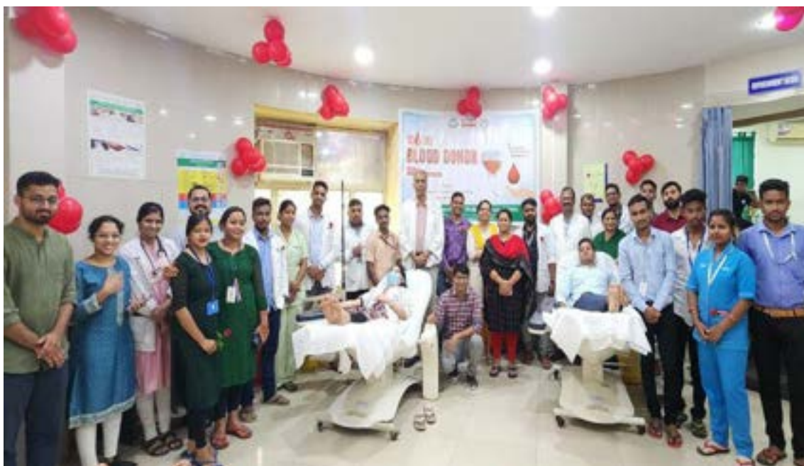
Fig: World Blood Donor Day 2024

More details can be found in the link: KIMS Celebrates World Blood Donor Day 2024