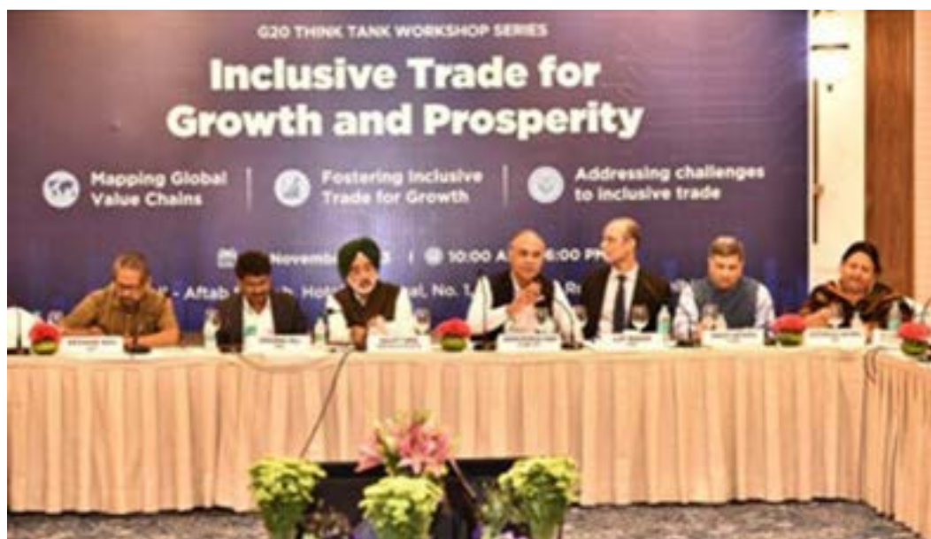
Fig.: KIIT Faculty Makes Presentation at G20 Think Tank Workshop