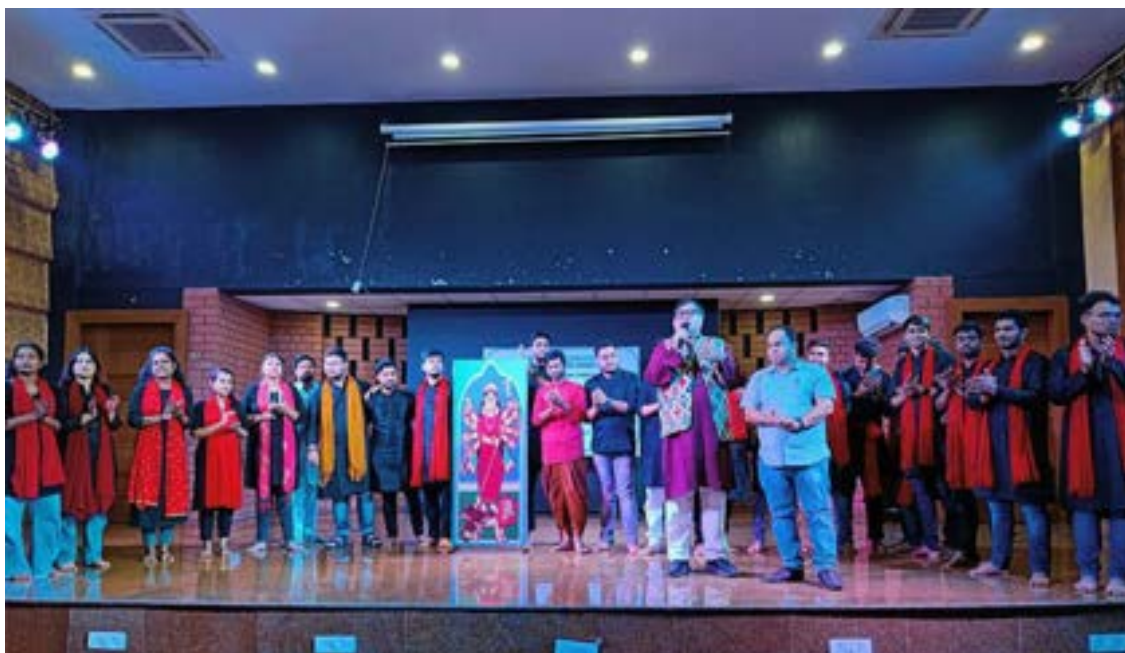
Fig.: KSRM Organizes 'Pratibimb' – A Street Theatre Festival