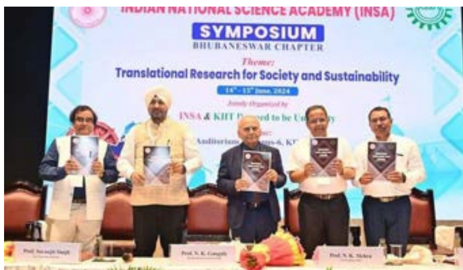
Fig: Symposium on ‘Translational Research for Society and Sustainability’

KIIT DU, recognized globally in THE Impact Rankings, has been actively contributing to sustainability through interdisciplinary research, fostering young innovators, and promoting eco-friendly technologies. With a strong focus on SDG implementation, the symposium reinforced KIIT DU’s role as a leader in integrating scientific advancements for societal welfare.