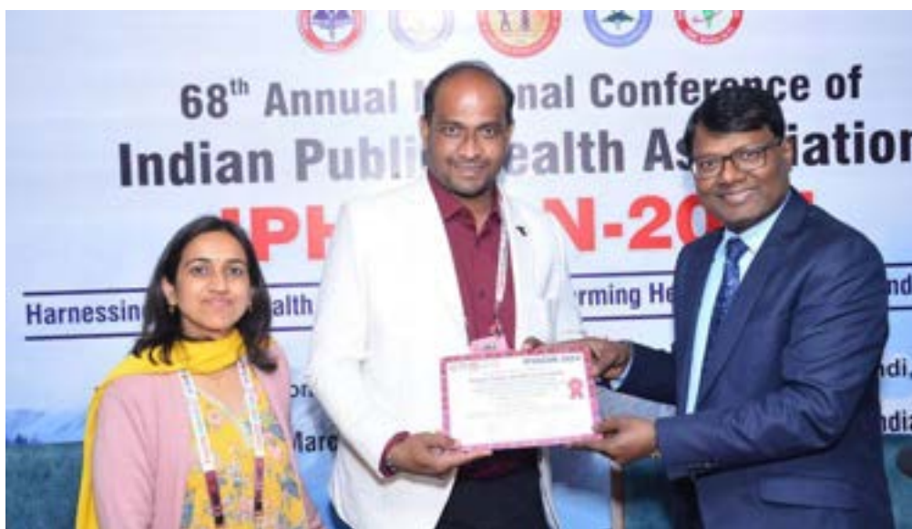
Fig: Accolades at IPHACON 2024