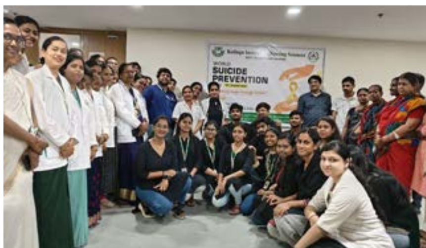
Fig.: KINS Observes World Suicide Prevention Day

The students put forth messages that people with stress should have thought about their life’s value as the first priority for self and not to set value of self by the judgment of others. Around 90 participants (patients, family members, students and staff) attended the programme. Next to this, poster presentation was done by B.Sc. (Nursing) third-year students to improve the knowledge of the public on causes of suicide and supportive system for prevention of suicide, and value for one’s own life. The programme ended with the speech about importance of suicide-free society, familial support as well as creating hope within a person to live his or her life, even though it has ups and downs. The observance was very effective and enriched with knowledge, awareness and really a fruitful one as the patients and their family members also got engaged enthusiastically in it.