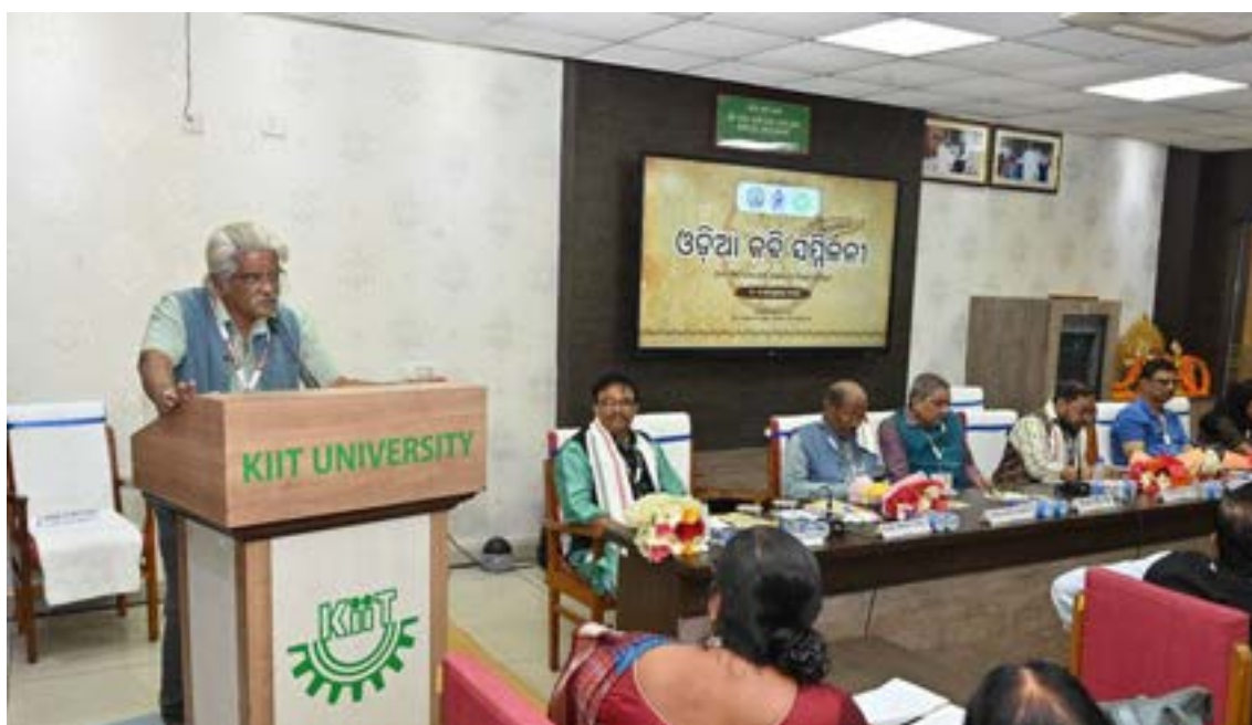
Fig: The First Odia Language Conference At KIIT

By organizing this event, KIIT DU reinforced its role as a leading institution promoting linguistic and cultural sustainability. Such initiatives align with its broader mission of fostering societal development through education, research, and cultural preservation, contributing to Sustainable Development Goals (SDGs), particularly SDG 4 (Quality Education) and SDG 11 (Sustainable Cities and Communities).