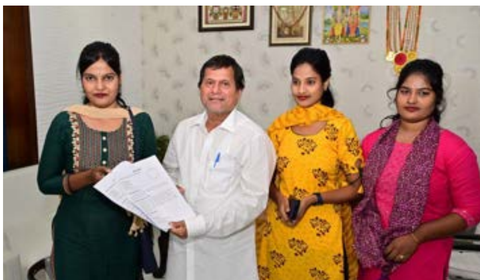
Fig.: Lives of 4 orphan sisters changed by KISS Foundation