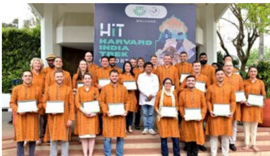
Fig: Harvard-India Trek Delegation Visit

The visitors deeply admired Odisha's traditions, reflected in their adoption of Sambalpuri Kurtas. They also praised KIIT as unique institutions promoting education and societal sustainability. .