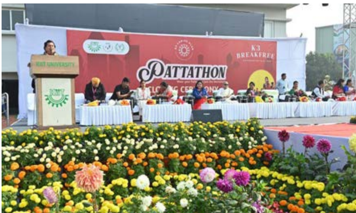
Fig: KIIT Women Employees in Traditional Sarees Participate in 'Pattathon' Mini Marathon

The event, organized by K3 Breakfree, highlights KIIT DU's broader commitment to sustainable development, social inclusion, and empowerment. By integrating education, sports, and community participation, KIIT DU continues to set benchmarks in societal sustainability and gender equality in 2024.