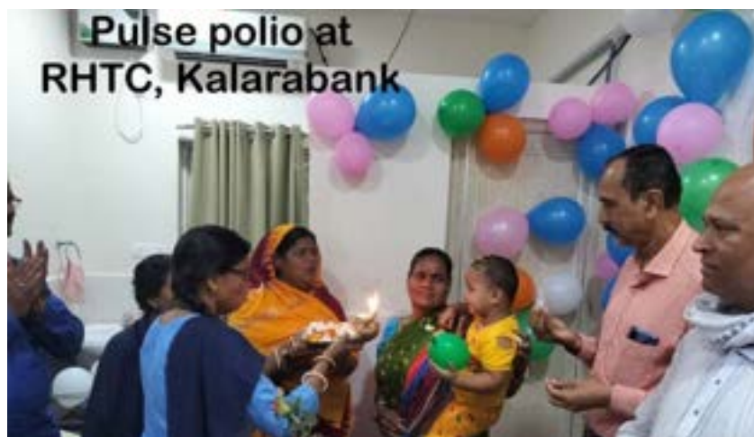
Fig: Pulse Polio Immunization Drive 2024

Monitor in Bhubaneswar. The success of this initiative highlights KIIT DU's dedication to public health and sustainable development, reinforcing its leadership in healthcare outreach and disease eradication efforts.