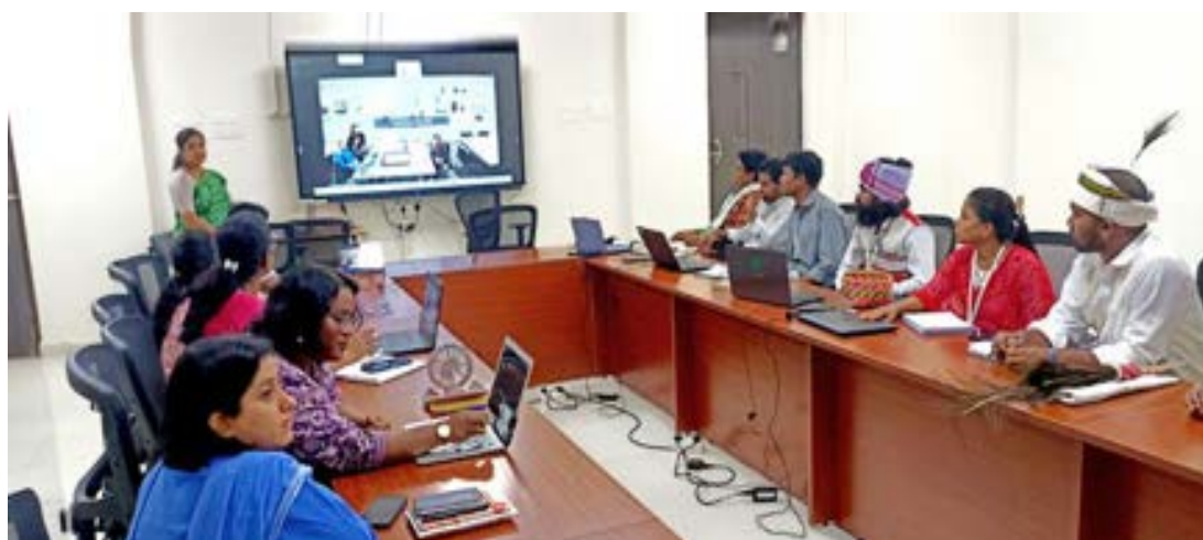
Fig: International Museum Day through Project K-MUSE