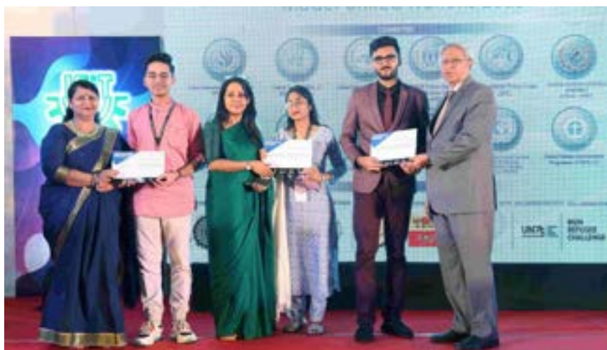
Fig.: KiiTIS MUN

More details can be found in link below: KiiTIS MUN Concludes with 800 students participation