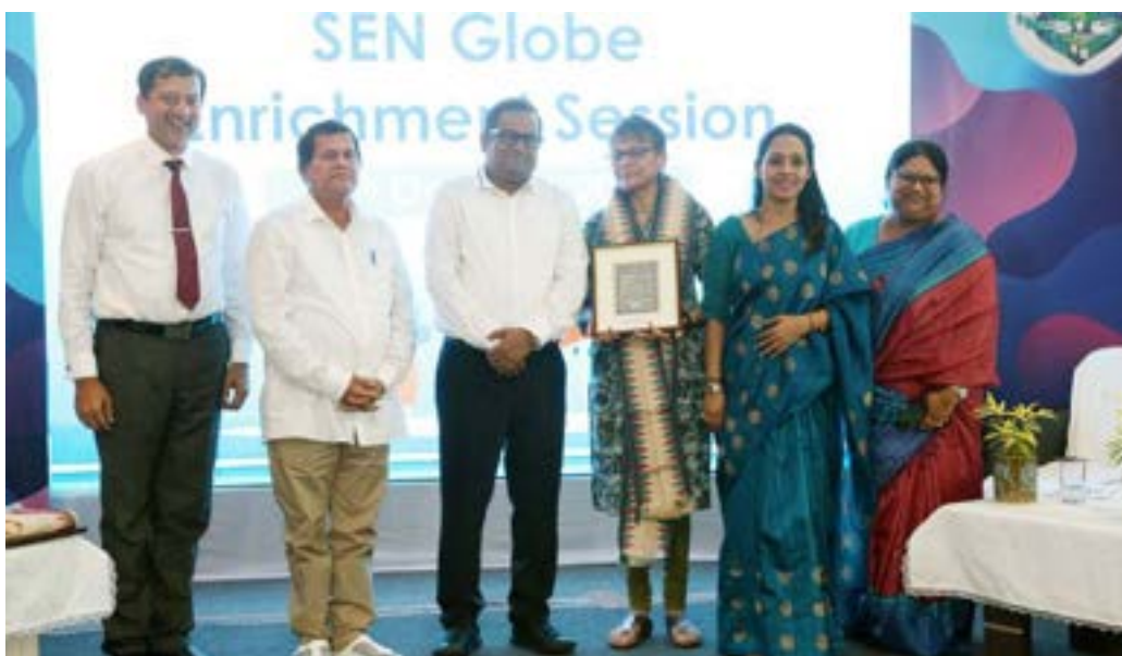
Fig.: KiiT-IS Signs MoU with Action for Autism for SEN Globe

documentary showcasing SEN Globe's transformative work.